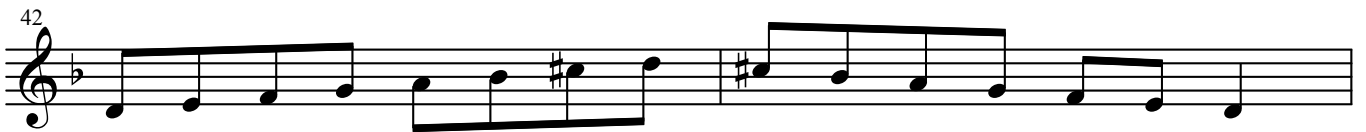
D Minor (1 Octave)