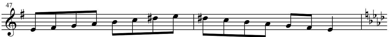
E Minor (1 Octave)