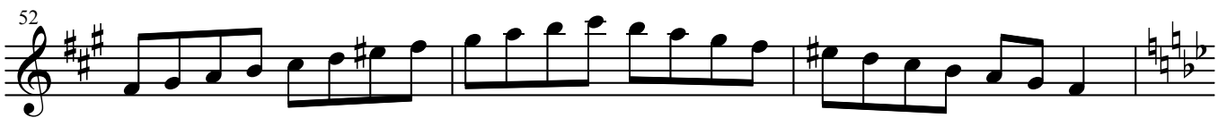
F# Minor (a Twelfth)