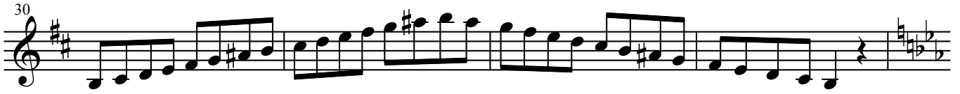
B Minor (2 Octaves)