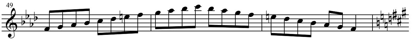
F Minor (a Twelfth)