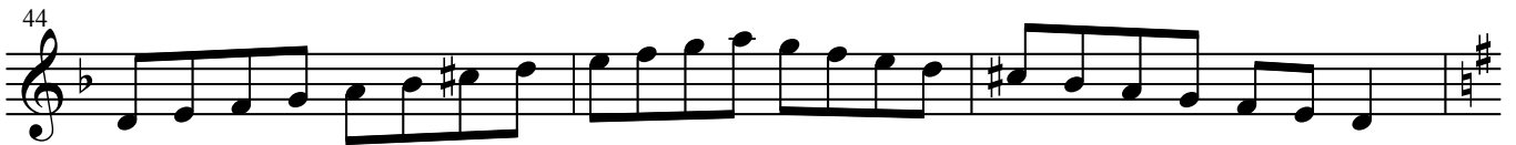
D Minor (a Twelfth)